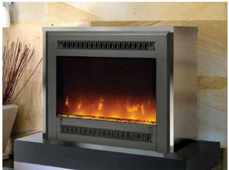
Metropolitan™ Face shown with Metro Mantel™

As an alternative to wood cabinet mantles, the Metro Mantel is constructed of brushed nickel sheet metal with a textured black power-coated hearth base. As you can see, the Metro Mantel is a striking contemporary accessory to the 564 E. All Architectural Double Door faces as well as the rectangular Metropolitan beveled faces will fit this fireplace and this mantle.