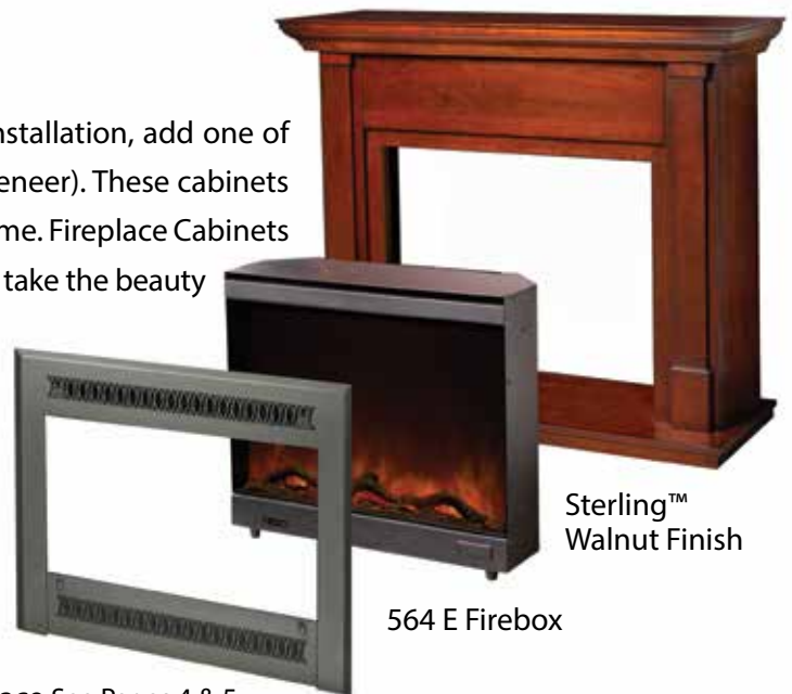
Face See Pages 4 & 5.