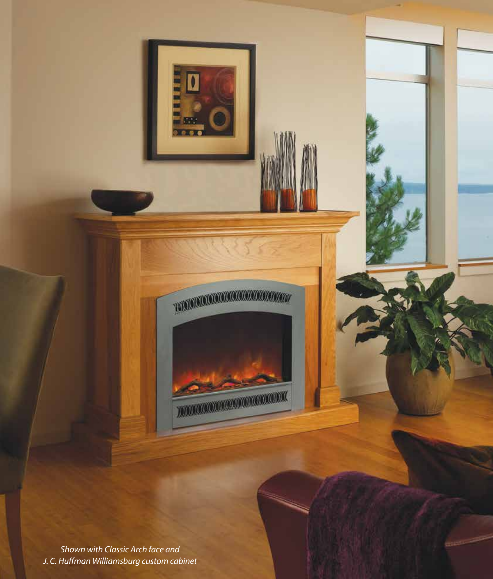
Shown with Classic Arch face and J. C. Huffman Williamsburg custom cabinet