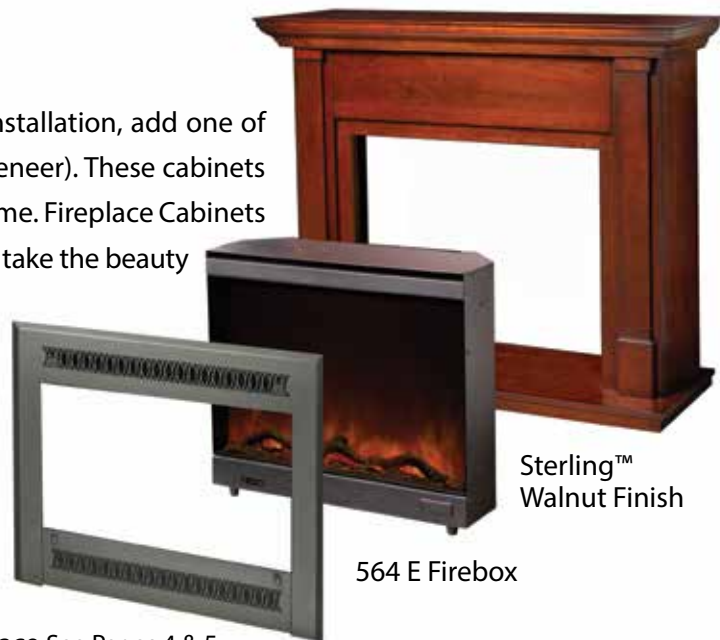
Face See Pages 4 & 5.